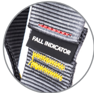
Rip stitch indicators