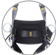
Work positioning belt