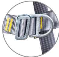
Front attachment point