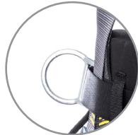
Fold back D rings