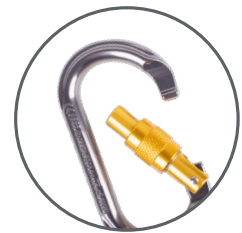
Screwgate closure and anti snag design